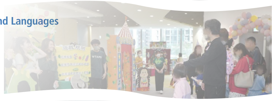
School of Nursing and Health Studies 護理及健康學院