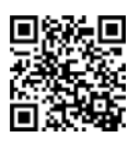
School of Arts and Social Sciences 人文社會科學院