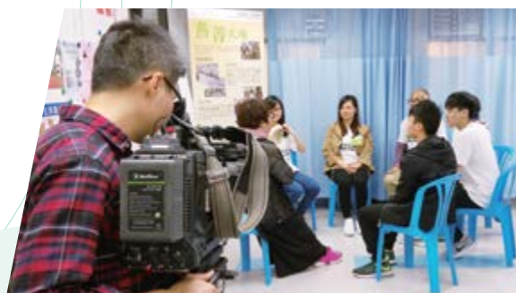
無線電視攝製隊拍攝同學探訪長者的情況。 TVB's filming crew captured students' visits to the elderly.