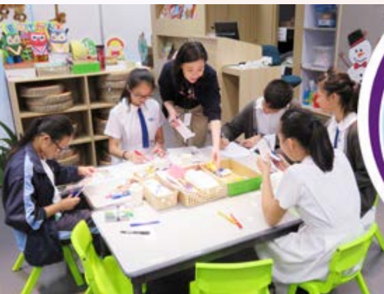
中學生參加「校園放大鏡」活動，在模擬機艙教室、模擬病房教室及模擬幼稚園教室體驗各行各業的工作。 Students at taster programmes "Campus Magnifier" in Mock-up Rooms

Since the 2014/15 school year, the Education Bureau has been supporting local schools in implementing life planning education and offering counselling services on further studies and employment. To that end, our Community Liaison and Institute Planning Team (CLIP) has set up five cluster teams (Hong Kong Island, Kowloon East, Kowloon West, New Territories East and New Territories West) to follow up with schools on the latest life planning activities offered by the Institute, such as workshops and talks on self-understanding, career exploration and personal planning. The service has received strong support from secondary schools since its introduction. We also encourage experiential learning and thus taster programmes are held in our modern teaching facilities, such as mock-up ward, cabin, hotel room and kindergarten classroom. Students can learn from these simulated workplaces in an enjoyable approach. As of April 2017, we have served over 16,000 people. We were also involved in various staff training and parent talks in secondary schools, so as to enhance the understanding of life planning of different stakeholders.