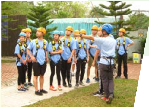
歷奇訓練日營 Training Camps