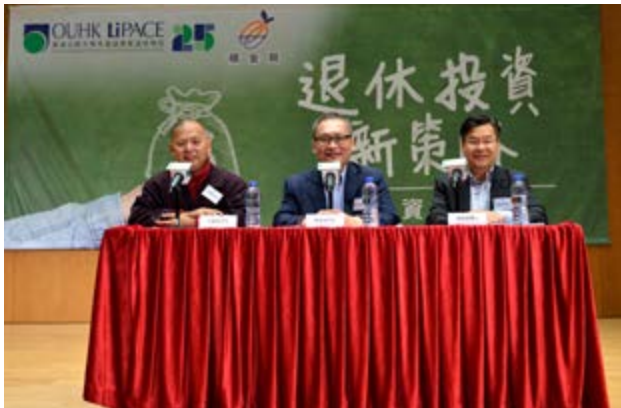
問答環節 Q&A Session