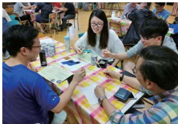
生涯規劃教師培訓講座 Life planning training for teachers