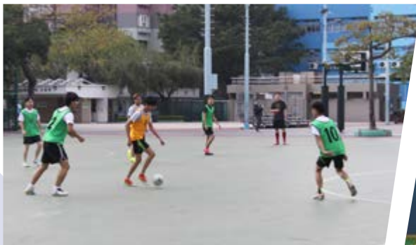
足球比賽 Football Competition