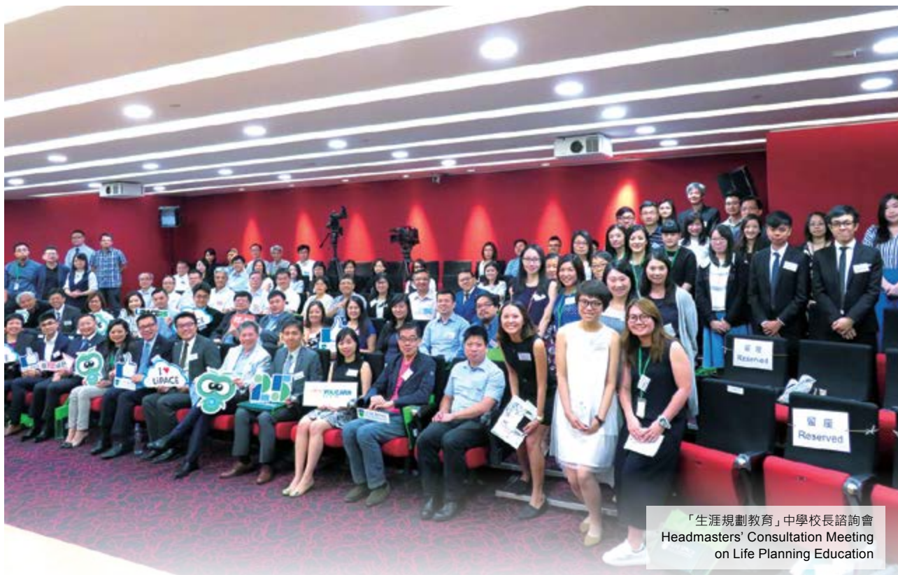
「生涯規劃教育」中學校長諮詢會 Headmasters' Consultation Meeting on Life Planning Education