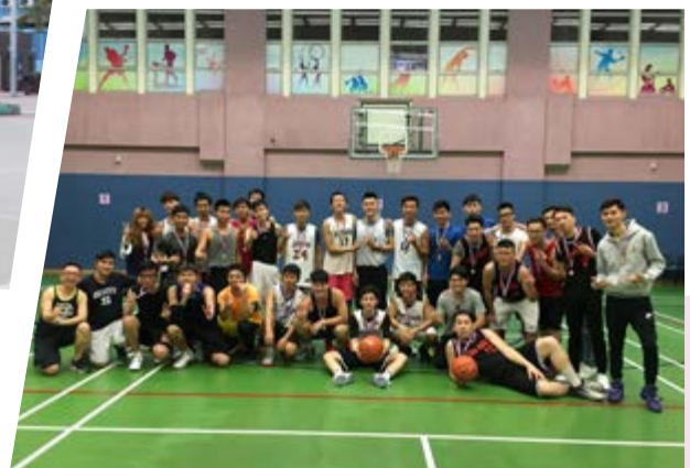
籃球比賽 Basketball Competition