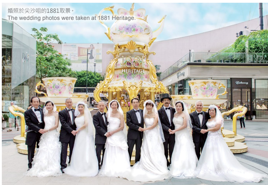
婚照於尖沙咀的1881取景。 The wedding photos were taken at 1881 Heritage.

有謂「好趁青春留倩影」，人人都希望好好記錄自己的花樣年華，特別是終身大事，所以穿上婚紗和禮服拍攝一輯專業的婚照已經成為現今新人的指定動作。相對數十年前、物質較困乏的年代，拍攝婚照是件奢侈的事情，加上當時人們大多按照中國傳統穿著紅色的裙褂成婚，故現在大部分公公婆婆都未曾披過婚紗或禮服。本院於4月19日，安排6對就讀本校「長者學苑」的長者穿上婚紗和禮服，並由專業化妝師及攝影師親自操刀，為他們送上一輯雖遲來但難忘的婚照，展現無分界限的美。