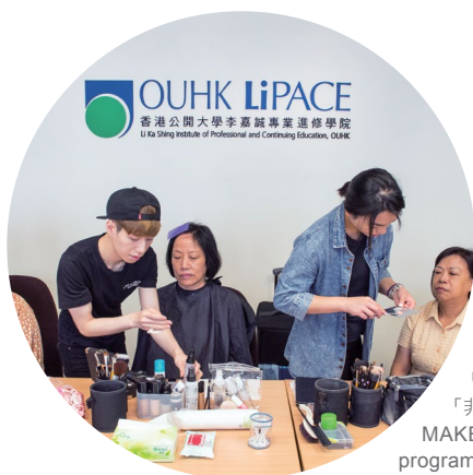
「創意形象造型及化妝學專業文憑」合辦機構 「非常作」的專業導師提供化妝造型。 MAKE UP FOREVER Academy, LiPACE's programme partner, sent their makeup artists.