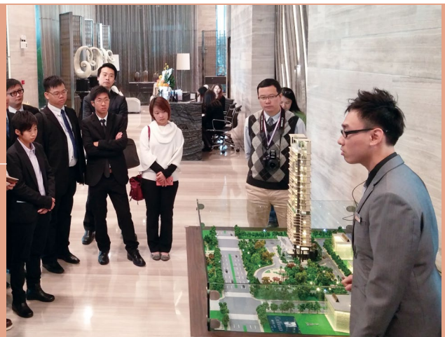
學院安排學員到廣州參加物業管理考察交流團。Students joined a study trip to Guangzhou.

To recognize the academic achievement of outstanding graduates of 2014, the GCIPM Prize and Fung Seng Enterprises Prize were presented to 4 graduates, each receiving HK$3,000.