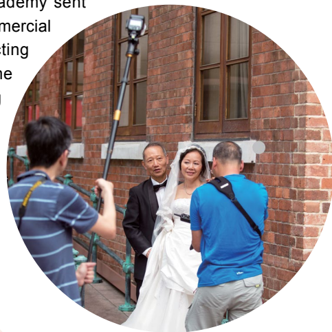
「商業攝影專業文憑」的師生負責拍攝。 Instructors and students of “Professional Diploma in Commercial Photography” worked behind cameras.

It is a universal desire to capture the golden moments of life – many see their weddings as the highlight among those moments. Wedding photography was far less popular in the old days, and thus most of today's elderly have never tried on a tuxedo or wedding dress. LiPACE, together with programme partners, helped six elderly couples to recapture the magic by taking professional wedding photos for them. On 19 April, teaching partner of “Professional Diploma in Wedding Planning and Event Management” France Bridal sponsored the costumes; while programme partner of “Professional Diploma in Creative Image Styling and Cosmetology” MAKE UP FOR EVER Academy sent their makeup artists; with instructors and students of “Professional Diploma in Commercial Photography” working behind cameras. The elderly enjoyed every process: selecting costumes, fitting, styling and posing. Even the professionals had a wonderful time making the couples' dreams come true. This inter-generational activity, showing beauty is truly unbounded, was a great success.