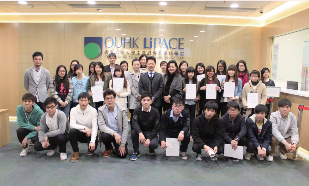
「卓越表現計劃」及「原校升學計劃」得獎同學一起出席頒獎儀式。 Awardees of the 2 scholarship schemes united at the presentation ceremony.