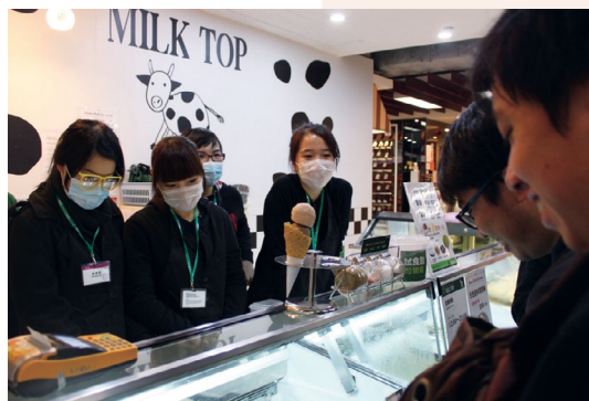
「一日店長」活動讓學員於MILK TOP分店推銷自己設計的口味。 The winning students promoted new flavours to customers in a MILKTOP branch for the “One Day Manager” scheme.