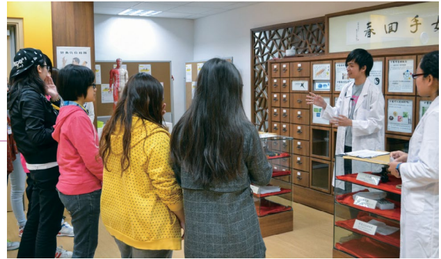
同學參加「職業體驗遊戲」活動，透過真實的工作場景及道具，體驗不同工作。Students took part in the CareerLive activity to experience career-related tasks through well-simulated occupational settings.

The Career Advisory Resources Centre (CARC) has recently been established under the Quality Enhancement Support Scheme funded by the Education Bureau, to provide career consultation service to LiPACE's full-time students. CARC regularly organizes workshops, seminars,