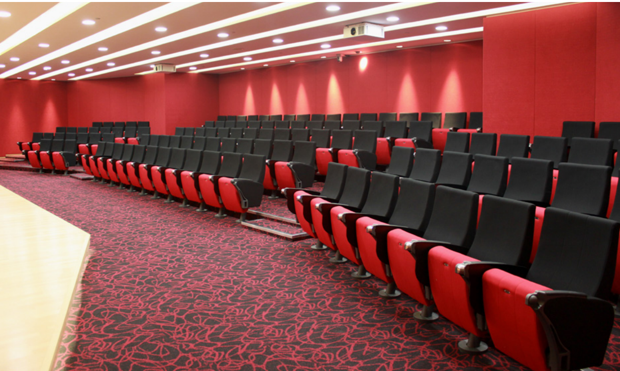
演講廳 Lecture Theatre