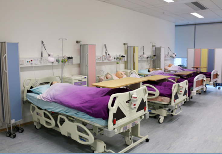
模擬病房教室 Mock-up Ward