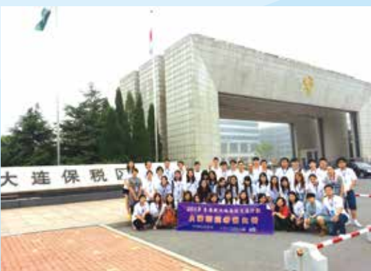
大連「暑期經貿考察之行」 Business & Trade Environment Summer Camp in Dalian

During the 2-week Business & Trade Environment Summer Camp in Dalian, our students from BA (Hons) in Business Management were invited to broad discussions on contemporary business topics. This gave them new insights into core economic issues. Students were enriched enormously by the hands-on learning and life experience.