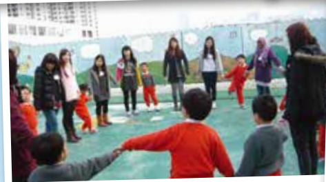
幼兒服務義工訓練 Children's Service Training