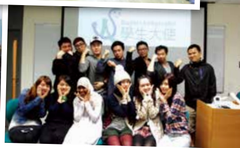
學生大使 Student Ambassadors