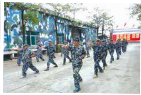
深圳黃埔青少年軍校訓練營 Shenzhen Huangpu Youth Military School Training Camp

「警政資訊站」滅罪活動 Police Clinic: Anti-Crime Promotion