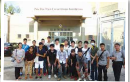
白沙灣懲教所 Pak Sha Wan Correctional Institution