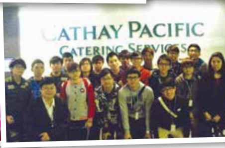
國泰航空飲食服務有限公司 Cathay Pacific Catering Services Limited