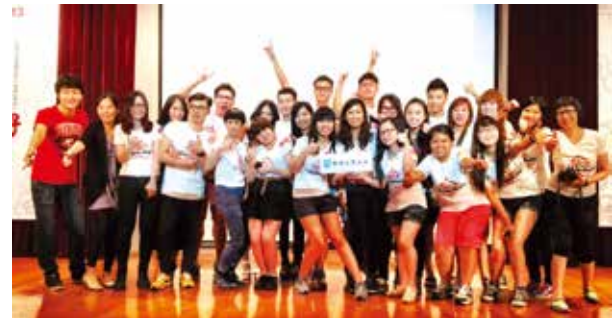
同學參與迎新晚宴上的表演節目。 Students performed in the welcome dinner.

由大連外國語大學舉辦的「暑期經貿考察之行」則為期 2 週，讓修讀工商管理同學一起研習「中國發展服務貿易的戰略選擇」、「國際金融危機的產生與應對」及「中國國際貿易發展的現狀與問題」等商貿課題。多個考察活動更幫助同學體驗內地的營商環境和文化。本院 BA (Hons) in Business Management 的同學有幸參與其中，無不認同「讀萬卷書不如行萬里路」的道理！