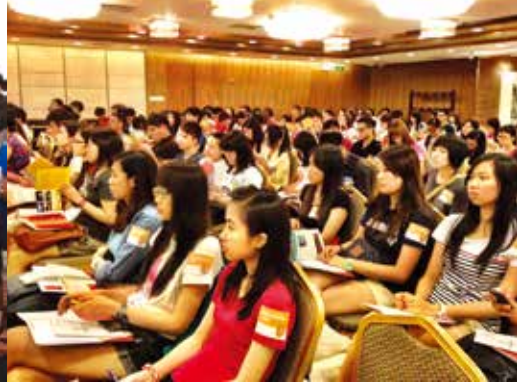
北京大學暑期學校 Peking University Summer School