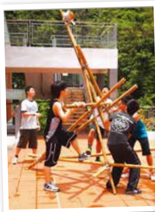
領導訓練營 Leadership Training Camps