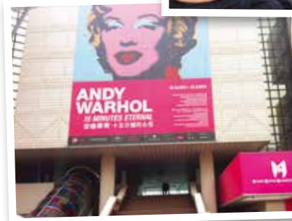
藝術及設計展 Art and Design Exhibitions