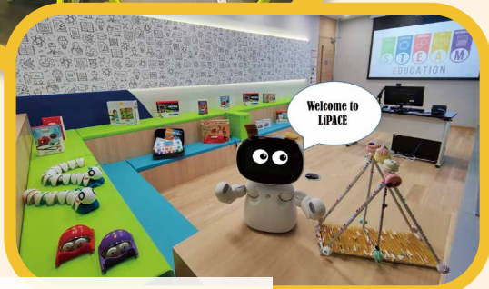
學院設有幼稚園模擬課室及 STEAM 教室