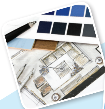
室內設計 Interior Design