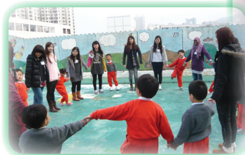
幼兒教育高級文憑 Higher Diploma in Early Childhood Education

The Institute's Diploma, Yi Jin Diploma and Higher Diploma programmes are registered under the Qualifications Framework as Level 3 and 4 programmes. Some overseas degree programmes are registered as QF Level 5 and enjoy similar status of local programmes.