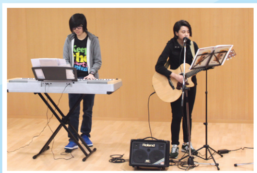
SAO 籌辦的午間音樂會，為愛好音樂的同學提供表演平台。SAO organized lunchtime concerts for students to showcase their musical talents.

The Student Affairs Office (SAO) was set up under the Institute's Registry Unit in January 2014, in response to the continuous growth in the full-time student population. SAO will become a centralized place to provide assistance to students in their learning and personal development.