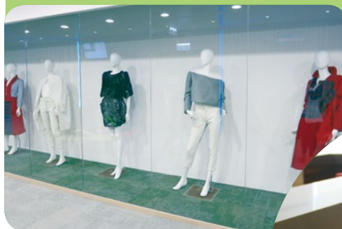
時裝作品展示櫥窗 Fashion Design Display