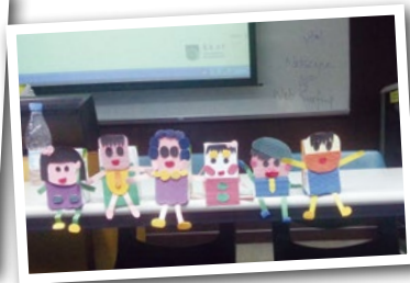
同學在課堂上實踐教學計劃。Students planned and tried out curriculum in class.