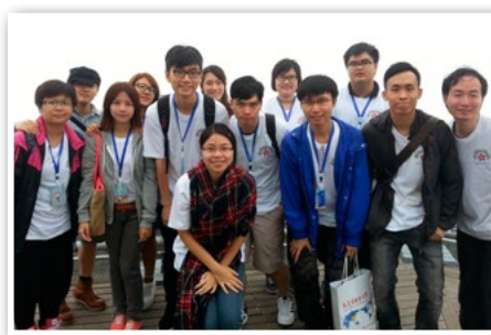
本院師生與香港公開大學李兆基商業管理學院同學於大連市合照。 Photo taken in Dalian with OUHK students from Lee Shau Kee School of Business and Administration