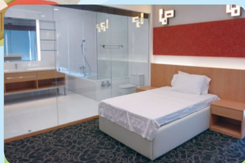
模擬酒店房間教室 Mock-up Hotel Room