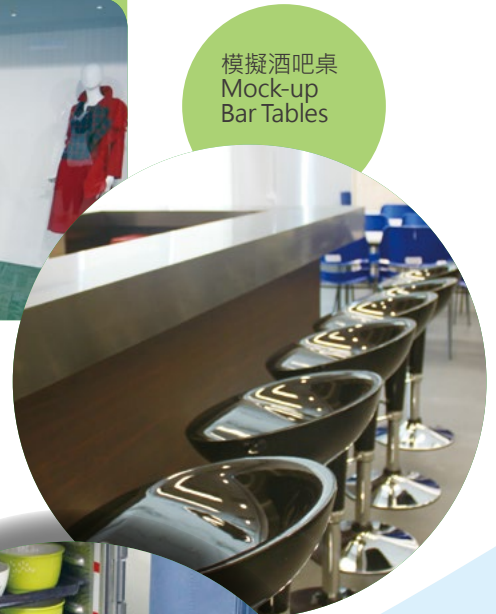
模擬酒吧桌 Mock-up Bar Tables