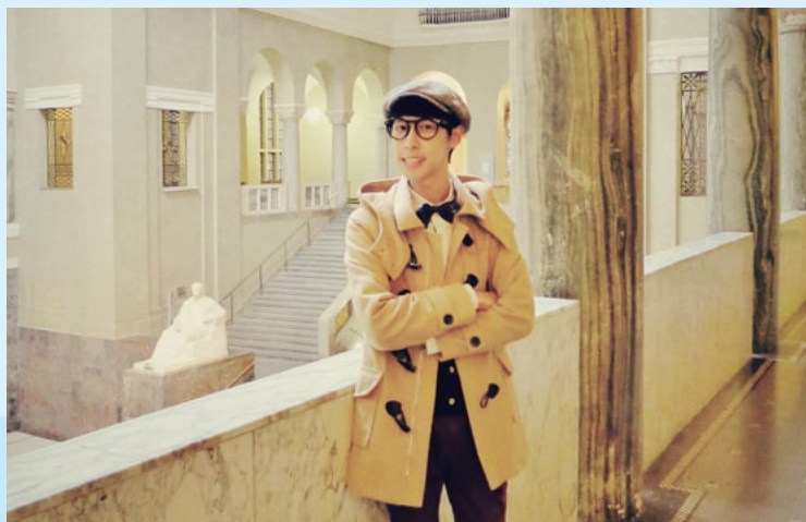
攝於慕尼黑大學 Taken at University of Munich