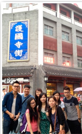
於護國寺街體驗北京人民生活文化 A trip to Huguosi Street to experience the Beijing local lifestyle