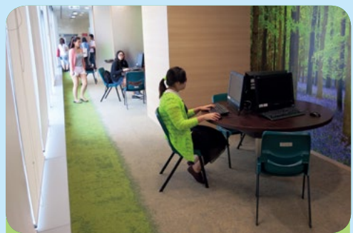
休閒電腦區 Computer Areas