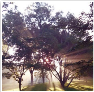
北京大學未名湖的晨曦 Dawn at Wei Min Hu in Beijing University