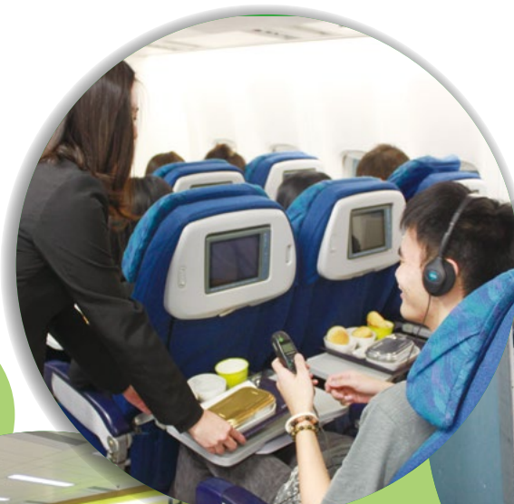
模擬機艙教室 Mock-up Cabin