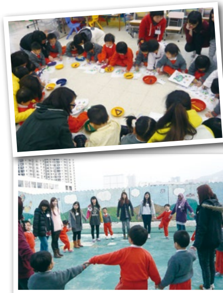
同學參與幼兒園義工服務，汲取經驗。 Students gained practical experience through voluntary service.

課程考慮到學生有需要接觸更多本地幼兒教育機構，因此從去年開始，學生有機會進入本地幼兒園，以義工身份與幼兒園的孩子們進行小組活動。