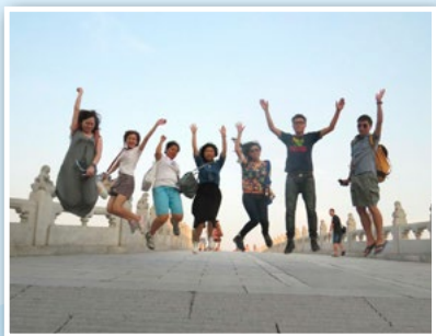
本院學生與公開大學人文社會科學院同學 於北京盧溝橋上合照 Photo taken on Lugouqiao with OUHK School of Arts & Social Sciences students.

交流活動一向是培養年青人獨立成長的機會。我們在國際學生宿舍一起生活的五個星期，學習洗衣乾衣和慳水慳電。我們都是首次離開家人自行生活，這次學懂了獨立處理問題，及有條理地執拾同伴共用的生活空間。現在回想起來，我們都感到自己真的成長了許多！