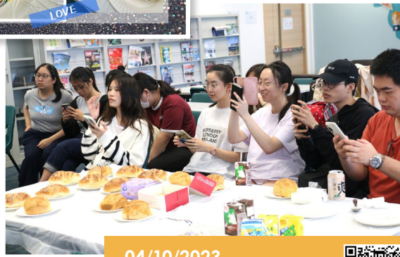
04/10/2023 我們一齊港 (講) ! A Taste of Hong Kong Food, Drinks and Slangs