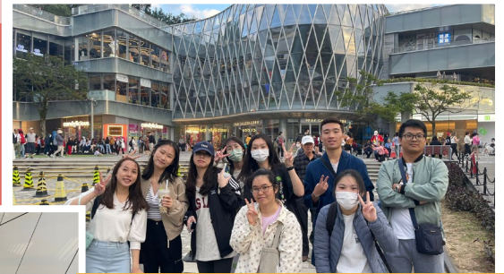
28/11/2023 體驗香港一山頂導賞 A Taste of Hong Kong- The Peak Experience