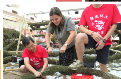
20/09/2023 大坑舞火龍工作坊 Tai Hang Fire Dragon Dance Workshop