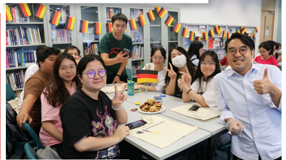
12/10/2023 認識德國 Getting to know more about Germany