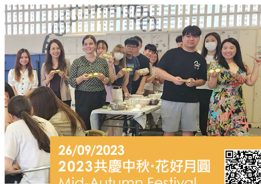
26/09/2023 2023共慶中秋·花好月圓 Mid-Autumn Festival Celebration