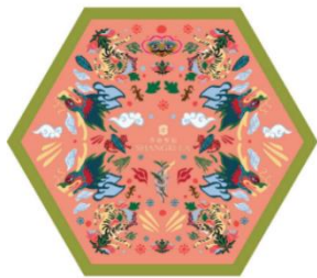
Shang Palace Taste of Asia Gift Box (box of 6) 香宮亞洲風味禮盒 (一盒六隻) Original Price: HK$628 Discount Price: HK$439.6