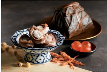
26-head Yoshihama abalone and Yunnan ham dumpling 26 頭吉品乾鮑魚金腿糰 Original Price: HK$1,988 Discount Price: HK$1,689.8