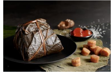
Sticky rice dumpling with dried scallop, pork and salted egg yolk 瑤柱裹蒸糰 Original Price: HK$248 Discount Price: HK$173.6