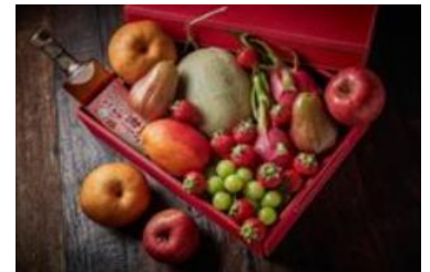
Shang Palace deluxe fruit hamper 香宮豪華水果禮物籃 Original Price: HK$2,388 Discount Price: HK$1,791