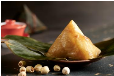
Sweetened lotus seed paste dumpling 蓮蓉棧水糰 Original Price: HK$88 Discount Price: HK$61.6