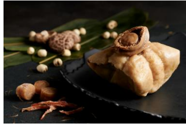
Sticky rice dumpling with abalone, dried scallop, roasted pork and salted egg yolk 鮑魚裹蒸糰 Original Price: HK$318 Discount Price: HK$222.6