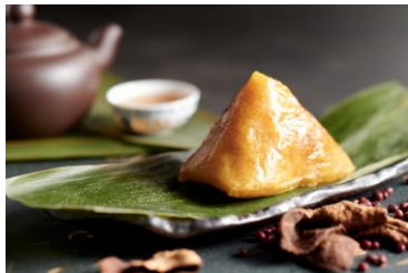
30 years tangerine peel and red bean paste dumpling 三十年陳皮豆沙糰 Original Price: HK$108 Discount Price: HK$75.6