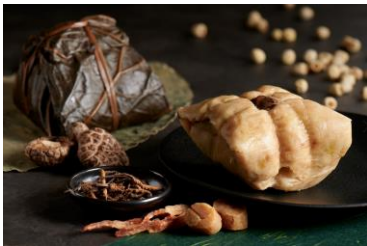
Master Chef Gift Box 香傳廚神禮盒 Iberico pork belly and cordyceps dumpling 蟲草西班牙黑豚腩糰 Price: HK$598