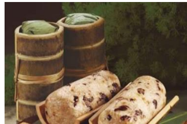
Morrel mushrooms, imperial fungus and assorted mushrooms five grains bamboo dumpling 羊肚菌如意野菌五穀竹筒素糰 Original Price: HK$198 Discount Price: HK$138.6